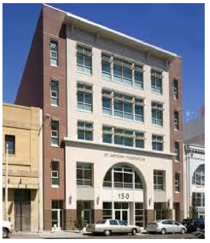
St. Anthony's San Francisco, CA